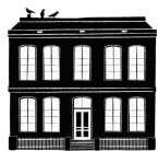
Little Sisters of the Poor

LITTLE SISTERS OF THE POOR will be present at all the Masses this weekend. We all know of their ministry with the elderly poor particularly at Queen of Peace Residence on the other side of Queens Village where they provide a safe and comfortable home for elderly men and women. The Sisters will be at the doors of the church as you leave Mass to receive your donations. Please be as generous as your means will allow.